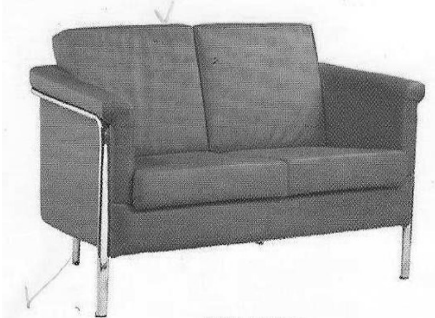
VIEW OF TWO SEATED SOFA